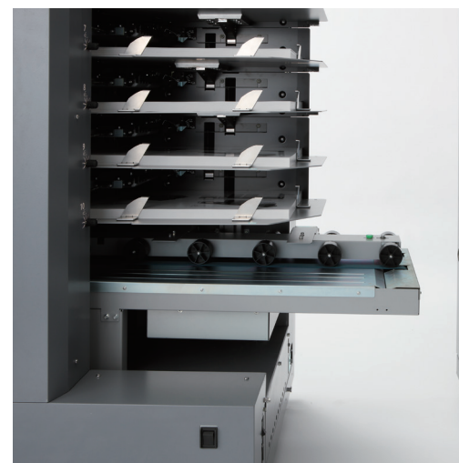
Optional bridge unit