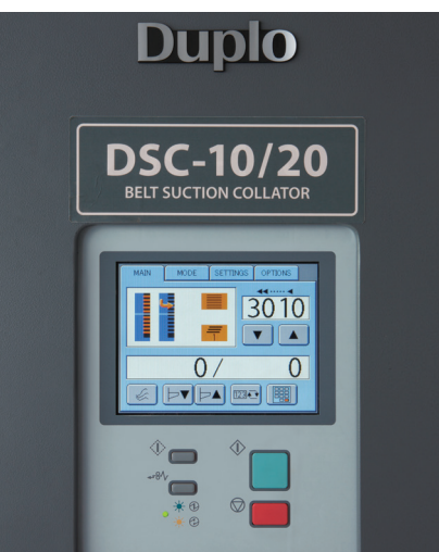
Colour touch screen

The DSC-10/20 collator can connect to a number of bookletmakers making it very easy to upgrade the system should the business's demands grow.