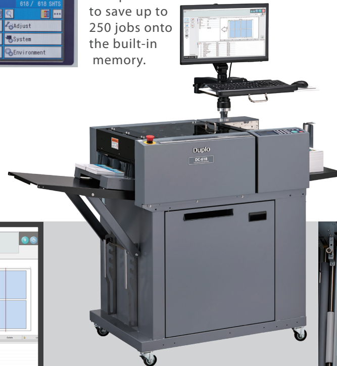
DC-618 shown with optional PC and PC arm.

color LCD control panel for set up and use it to save up to 250 jobs onto the built-in memory.