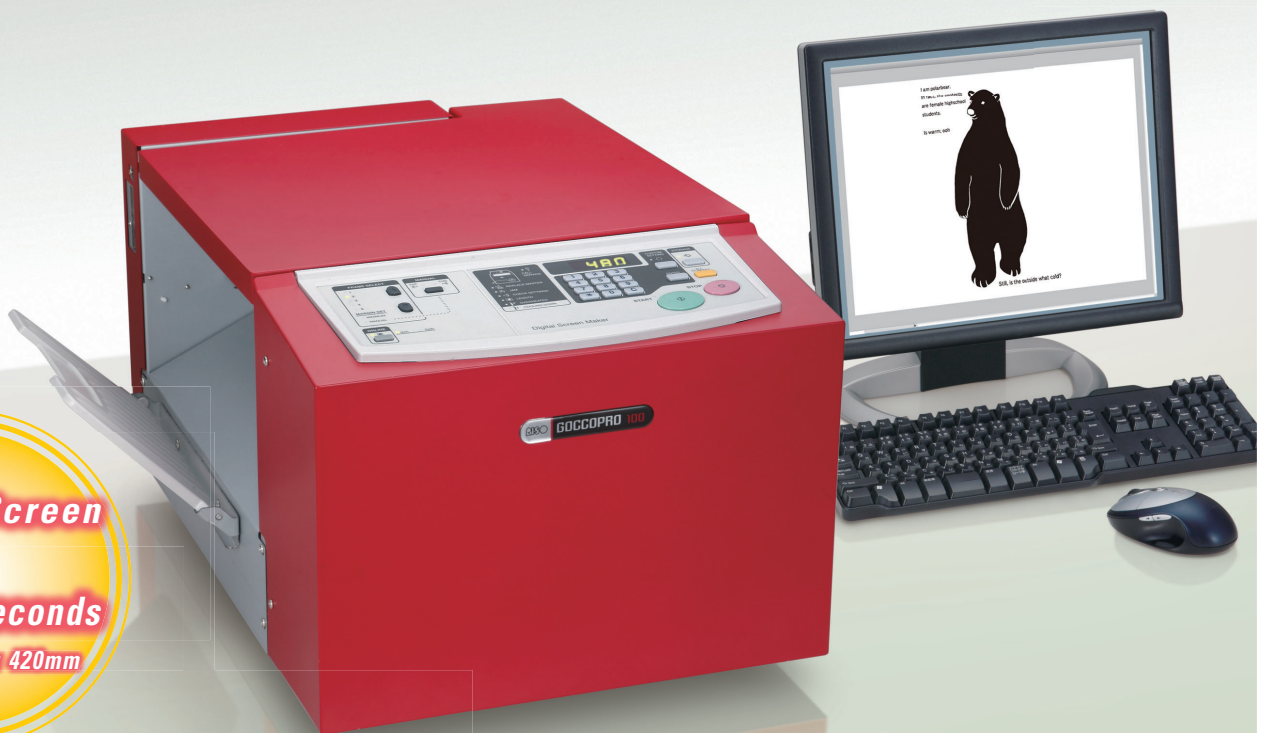
Image to Screen

NO Chemicals NO Emulsions NO Darkroom NO Water NO Film Positives