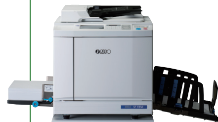
RISO Digital Duplicator

RISO Rice Bran Oil Ink is for RISO SF Series. (RISO INK F Type)