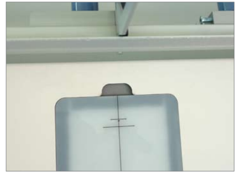
Registration marks for thicker and thinner materials offer you more versatility in applications.