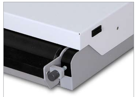
The integrated edge folding unit is adjustable for different cover board thicknesses.