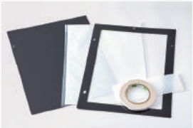
MiScreen a4 Screen Making Start-up kit