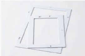
MiScreen a4; Card Stock Paper Frame