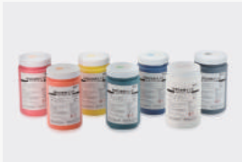
RISOAQUA INK 1,000ml