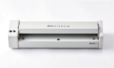
MiScreen a4 Main Unit

Included in the package: AC Adapter, Utility Software CD and User's Guide Not included: Power Cord for AC Adapter and USB 2.0 cable